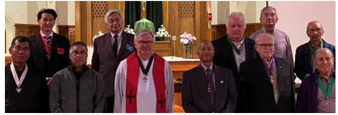
Welcome to the incoming Knights of Columbus Executive

Virtual meetings will be on Tuesday evenings from 7:30-9:00 PM starting October 20th. The cost is $40. No previous Zoom experience is required and financial assistance available upon request. For more information or to register, e-mail: biblestudies@staugustineschurch.ca